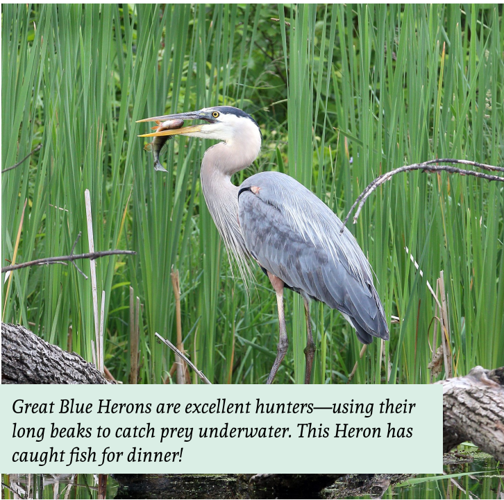
Great Blue Herons are excellent hunters—using their long beaks to catch prey underwater. This Heron has caught fish for dinner!

As we get into the fall weather this month, the colours will begin to change. The marsh looks beautiful lined by oranges, yellows, and reds in the trees—but hopefully we have a few weeks of sunshine yet!