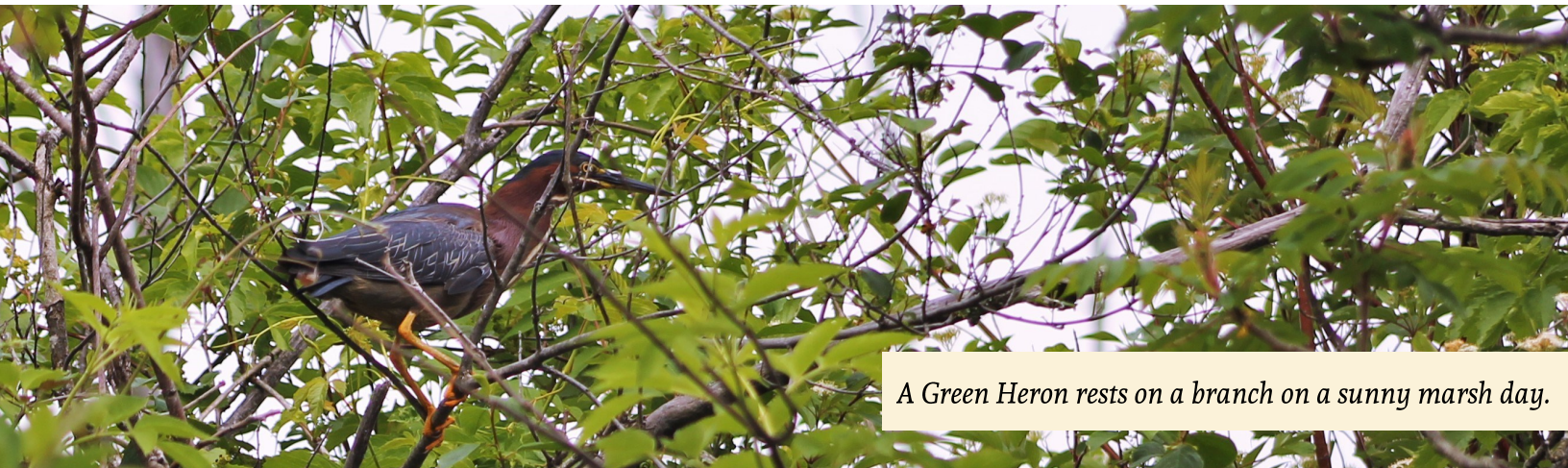
A Green Heron rests on a branch on a sunny marsh day.