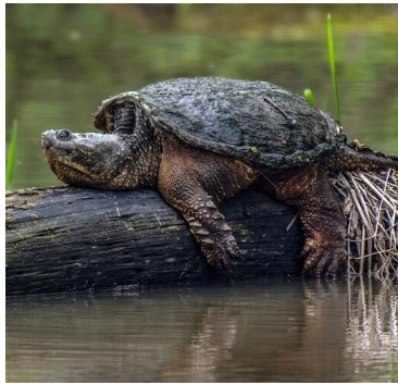
Common Snapping Turtle