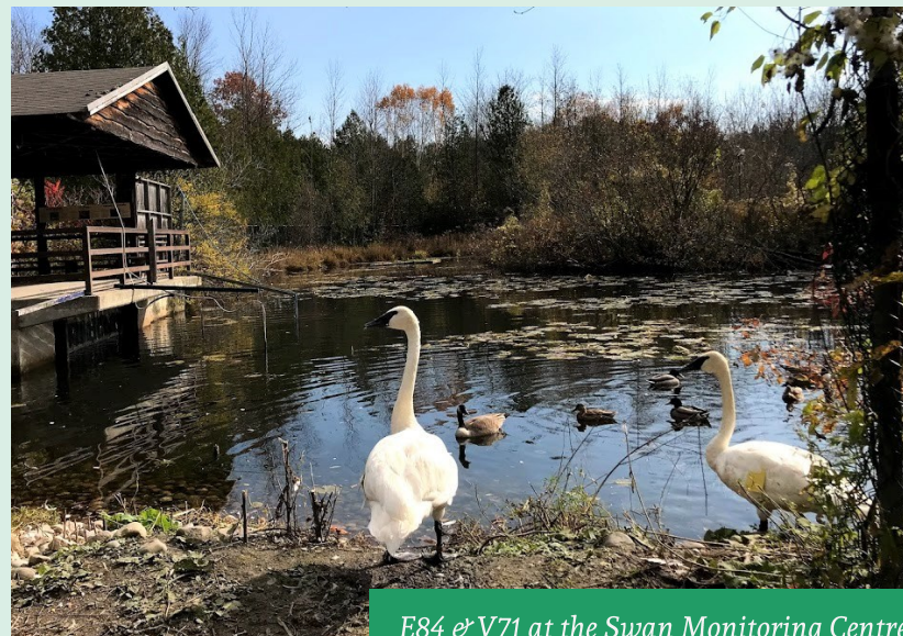
E84 & V71 at the Swan Monitoring Centre.

Staff are applying for grants to fund this work. We are happy to report that we have received funding from the TD Friends of the Environment Fund for the educational signage that will tell the story of the re-introduction of Trumpeter Swans, provide information on their species, and outline life in the marsh in all four seasons. We are very excited about this project, and will be providing updates as it takes shape. The planned completion for the project is Fall 2021.